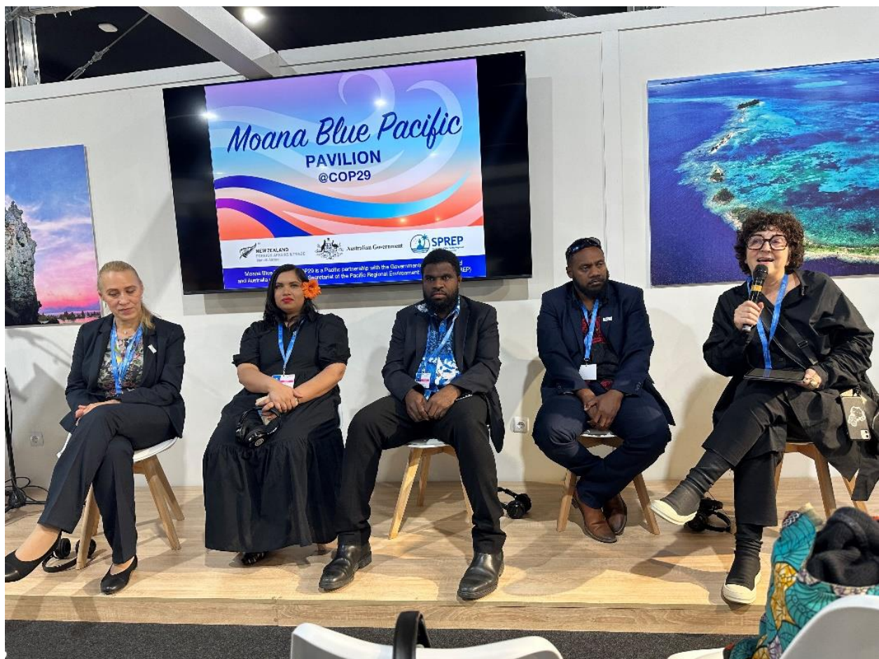
Experts from Fiji, Vanuatu, the Greenhouse Gas Management Institute and the Climate and Clean Air Coalition Secretariat.