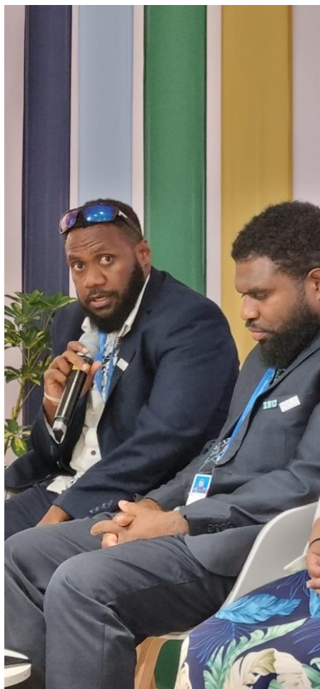
Sharing national experiences, and recent project involvement.