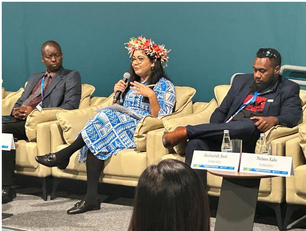
Sharing country experiences on the SAGE tool.