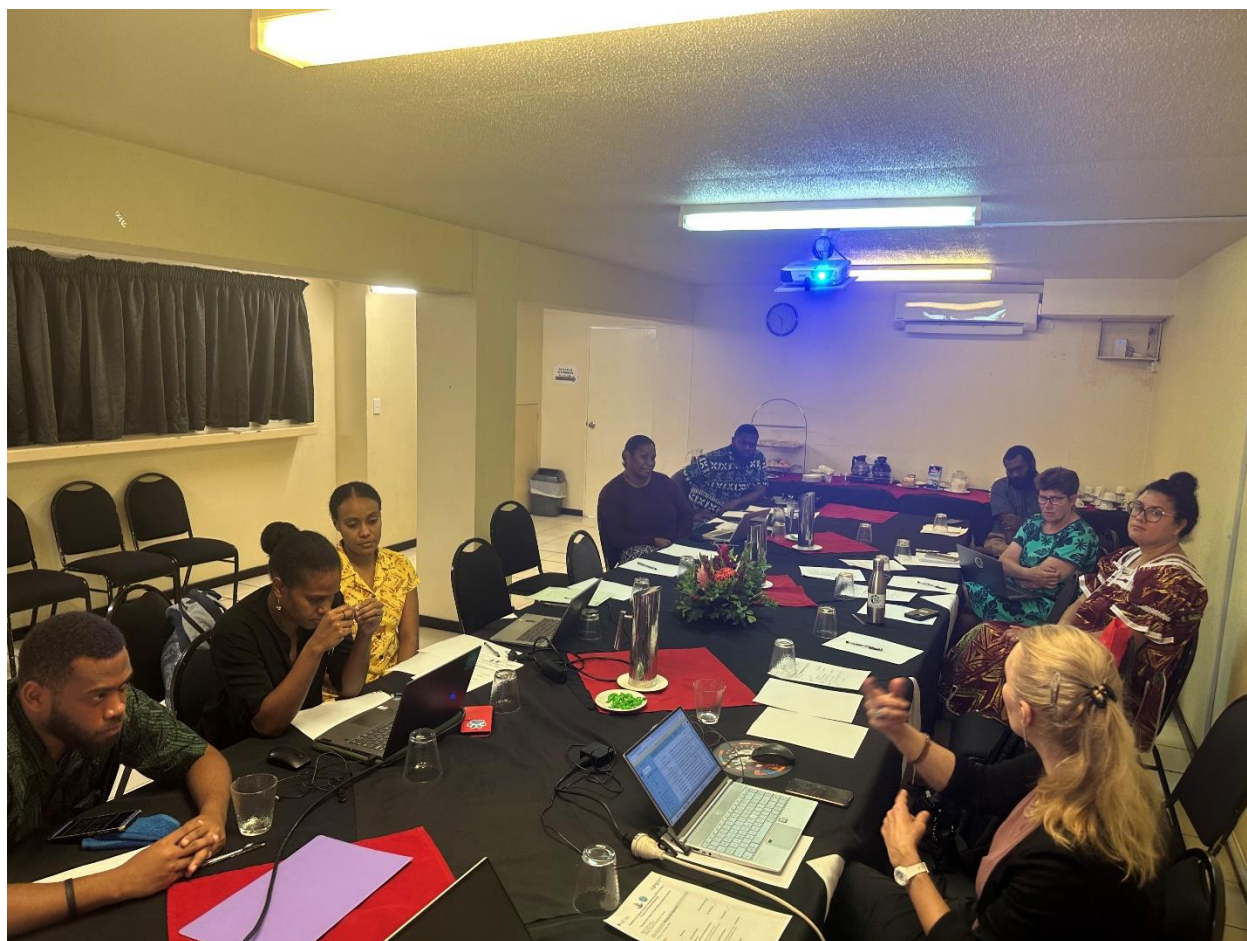
Lessons Learnt Workshop Discussions.